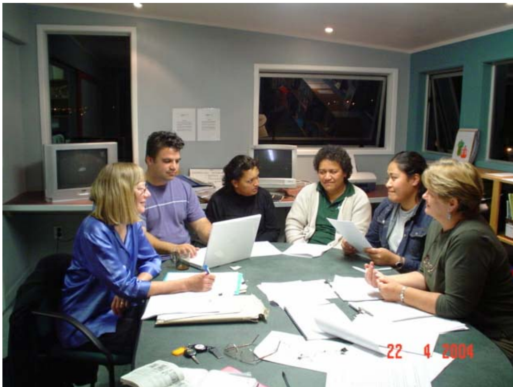
Photo 4: The A’oga Fa’a Samoa COI focus group: Some key members 2003-2006

An initial advisory group (convened 20 February 2003 to consult and finalise the research proposal) continued to provide advice for the research project. Several key interviews/discussions of the focus group yielded useful data for the study. In-depth discussions around the focus group topics/questions provided background information pertaining to the first research question: “What helps learning and language continuity as children make transitions within and from the Samoan language immersion centre?”